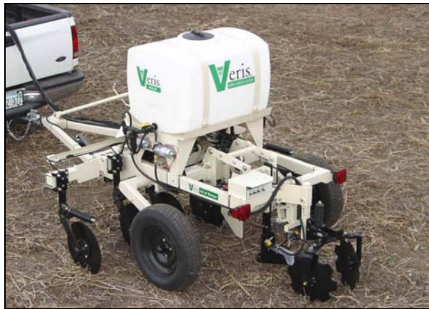
Figure 1. Veris Mobile Sensor Platform (MSP) equipped with pH Manager.

The Veris sensor adapts and automates lab technology for field use. In the lab, a soil sample is mixed with a specific amount of water, then an electrode is placed in the solution to read the pH. With the on-the-go sensor, a device scoops a small amount of soil, presses it against an electrode, waits for a moment for the electrode to stabilize, records the reading, and then rinses the mechanism to prepare for the next sample. The apparatus is mounted on a toolbar pulled by a pickup truck or small tractor. The sensor is marketed as the pH Manager option when purchasing the Mobile Sensor Platform (Figure 1), which includes the EC Surveyor 3150 to measure soil electrical conductivity.